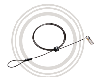
Kensington® Combination Cable Lock