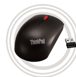
ThinkPad® Optical Wireless Mouse