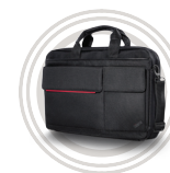
ThinkPad® Professional Topload Case